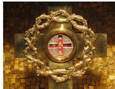
(Pictured above) Relic of the True Cross located at the Shrine of the True Cross in Dickinson, Texas.

The feast of the Exaltation of the Holy Cross celebrates two historical events: the discovery of the True Cross by Saint Helena, the mother of the Emperor Constantine, in 320 under the temple of Venus in Jerusalem, and the dedication in 335 of the basilica and shrine built on Calvary by Constantine, which mark the site of the Crucifixion.